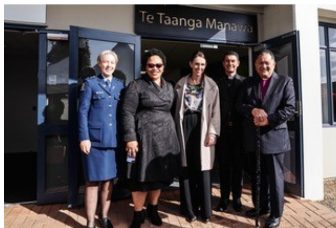
New Zealand Prime Minister, the Rt Hon Jacinda Ardern, opens Te Taanga Manawa

In the last few months, we have been part of an extremely effective partnership across a number of different agencies, and in particular with the police. The local police force made an agreement with the Whare and other agencies to lease a building together. The top floor houses police personnel who deal with family harm in the south Auckland area. The ground floor houses Te Whare Ruruahau o Meri and other agencies. The building has been named Te Taanga Manawa by our bishop, a name which refers to the heart of the people the agencies assist, and the heart of God towards humanity.