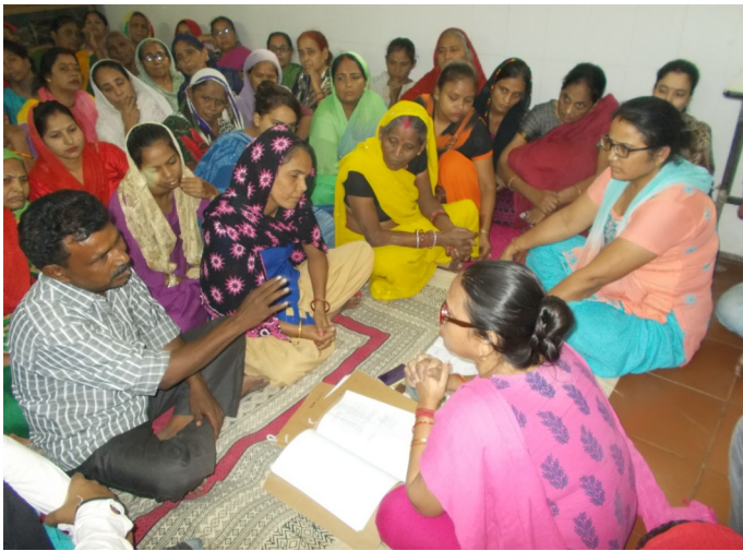
A case being discussed at the Mahila Panchayat: Women's Empowerment Programme, DBS