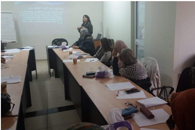
Running a workshop before COVID-19 lockdown

Due to the difficult situation and restrictions of movement, the awareness-raising and economic empowerment workshops that I usually conduct or coordinate for women in East Jerusalem have been frozen for safety reasons. Being under lockdown for more than 55 days at the very beginning of the pandemic was not easy. The lockdown has been renewed again in East Jerusalem since the last week of September, with tougher regulations and restrictions. What makes things worse is that many breadwinners have lost their jobs, which has worsened an already dire economic situation, or income has been minimized.