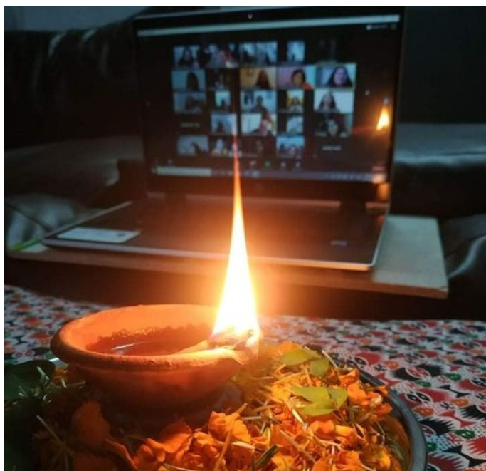
The Light of Christ: A flame was lit at the start of the webinar

commemorates the UN International Day of the Girl Child, and the 16 Days of Activism are in November. So we are initiating various forms of advocacy to promote gender justice.”