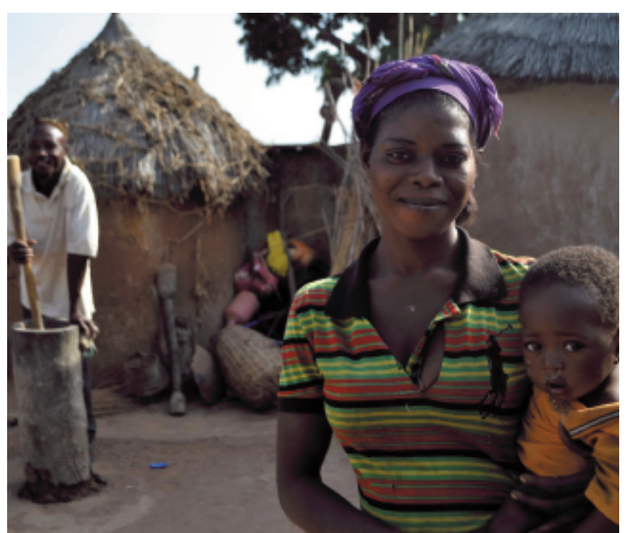
Happy family: sharing childcare and chores.