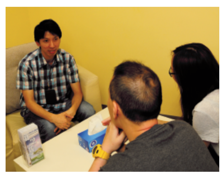
Counsellor helping couple with marriage problems.