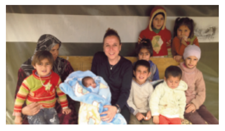
Family strength: Syrian refugees in Lebanon.