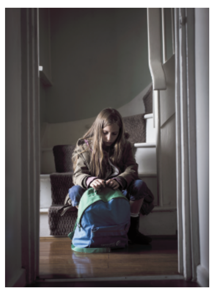
Photograph modelled for The Children's Society.