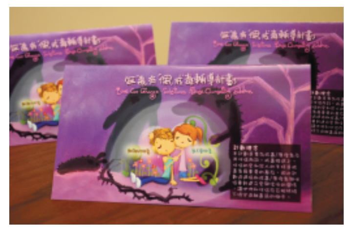
Love can change everything poster