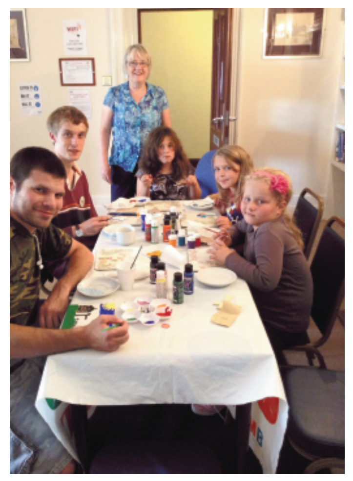
Children enjoying a craft session with the chaplain.