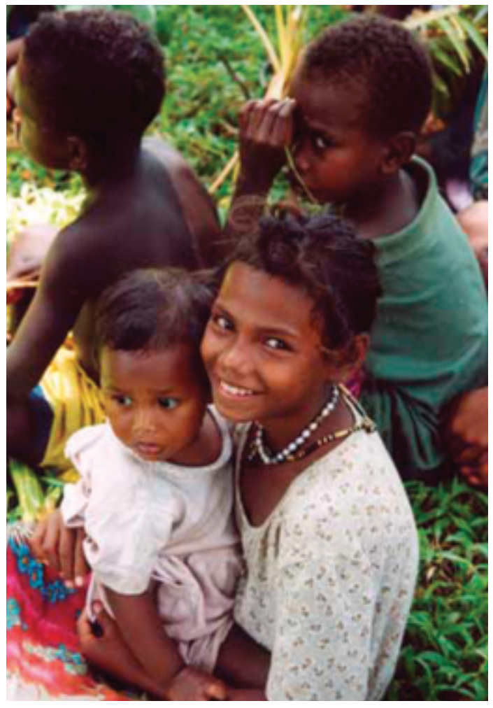
Positive parenting – Melanesia.